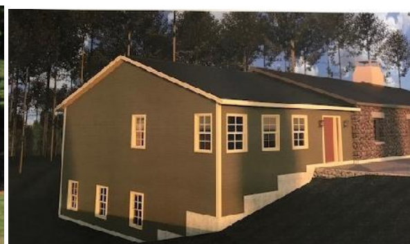
Honoring Our History, Our 75th Anniversary and Investing in Our Future

What better way to celebrate our 75<sup>th</sup> Anniversary than a Capital Campaign to renovate and expand our Hilltop House! The Capital Campaign funds will be used to redevelop the Hilltop House and create a two-story addition at the north end of the building. The new space will house a catering room, much needed handicap-accessible restrooms, a storage room, Peter J. Booras museum access, and an administrative office. Funds will also allow us to expand the outdated existing room, as well as to upgrade the lighting, flooring, doors, windows, and the heating, ventilation and air conditioning systems.